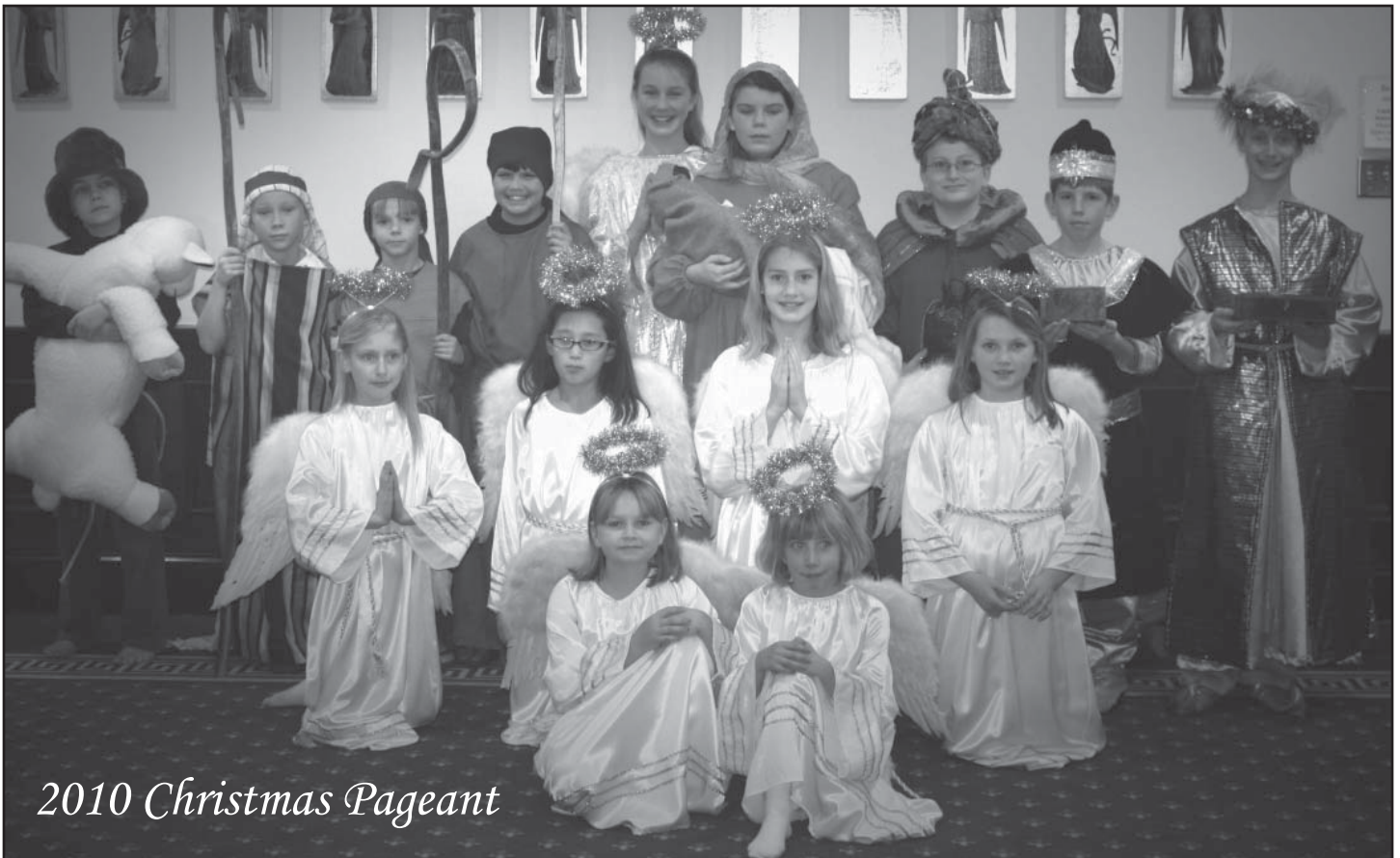
2010 Christmas Pageant